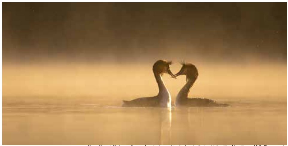
Great Crested Grebes perform sychronised courtship displays in Spring

As mists rise from the water's surface on early spring mornings, love is in the air as great crested grebe pairs join together to dance. These graceful courtship rituals denote the start of the birds' breeding season as the grebes look to successfully attract a mate with their synchronised salsas. With orange and black head plumes spread wide, an elegant pattern of head shaking, bill-dipping, 'mewing' (calling) and preening culminates in the famous 'penguin dance'. The performance reaches an astonishing crescendo as a pair of great crested grebes will rush together, paddling their feet frantically to raise upright from the water. Then, standing chest to chest, they flick a beak-full of water weed at each other before one final shake of the head and the weed is dropped, and the deal is clinched. In time, a suitably enamoured pair will move into their nest, floating safely in the reedy margins of the lake shore.